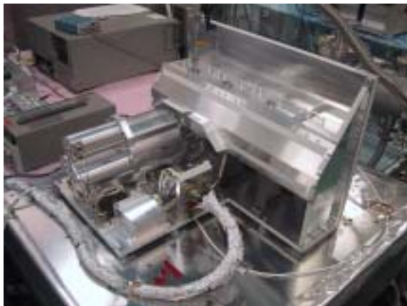
Fig. 2. Picture of the flight model, including a radiator.

GRS consists of three parts; gamma-ray detector (GRD), compressor driver unit (CDU) and gamma-ray and particle electronics (GPE). Since GRD plays a major role of GRS, this note is exclusively concerned with GRD.